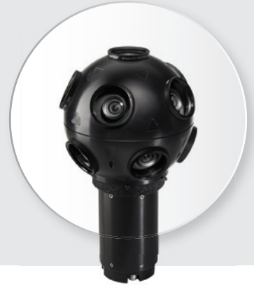
Dodeca® 2360 Immersive Video Camera.

Immersive Media's flagship product, the Dodeca® 2360 camera system captures high-resolution video from every direction simultaneously.