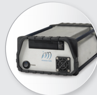
Dodeca® 2360 Micro Base Unit.

Remote Viewer for remote on-the-fly configuration managements, video playback and live monitoring. Custom Maxi Base (11 lbs, 75 watts) for use in helicopter applications.